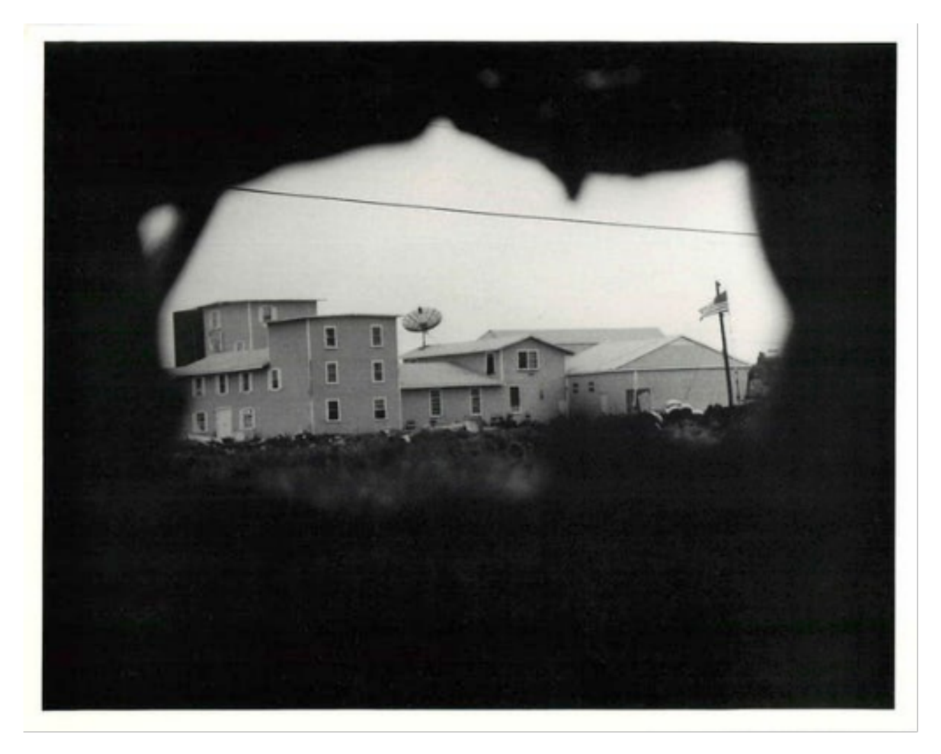
The Branch Davidians called their large communal house and church "Mount Carmel." The FBI referred to it as a "compound." This photo was taken during the siege by disapproving FBI snipers.